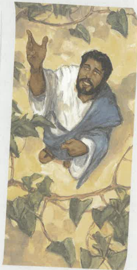
Jesus invites Himself to the sinner, Zacchaeus's house

named Zacchaeus. 1 He collected taxes and was called a "sinner" 2 by the people. Because Zacchaeus was a short man, he climbed a tree to see Jesus coming.