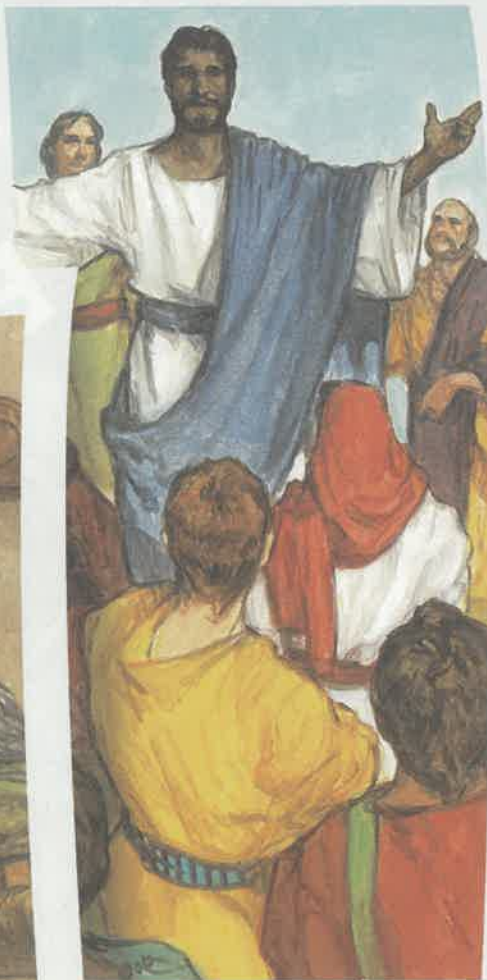
Jesus preaches to the crowds