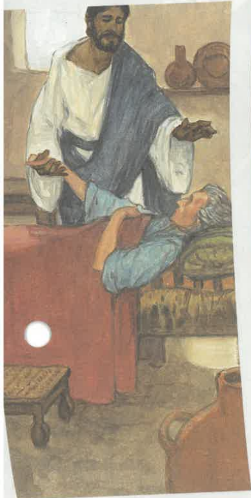
Jesus heals Simon's mother-in-law